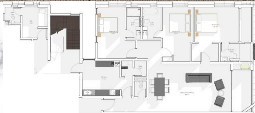
3 Bedroom Apartment - 168sqm